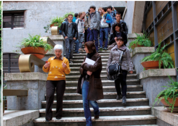
Above: Students from BHAK/HAS high school in Hallein (Austria) on a visit of Salerno